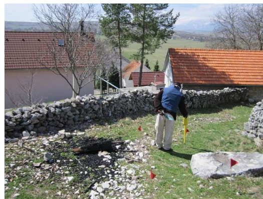
Photo 2 and 3 – Everyday life close to the area contaminated by cluster munitions