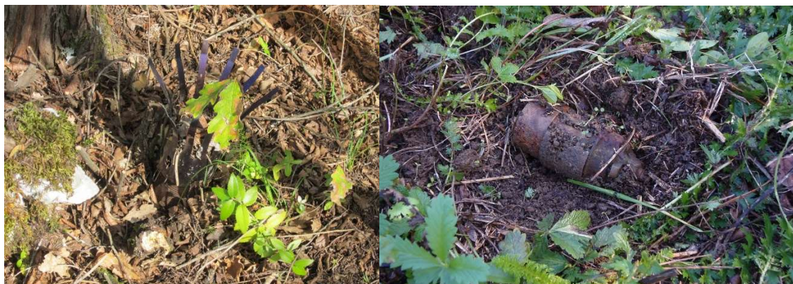
Type of cluster munition used and found in Bosnia and Herzegovina

Based on past experience and depending on weather conditions, delays are possible and deadlines can be postponed. The rest of the time for fulfilling the obligations under the Request of Extension (September 1, 2023) will be used for the finalization of the Convention report, submitting to the Implementation Support Unit of the Convention on Cluster Munitions for evaluation and adoption. Also, based on previous experience is very often that confirmed risk areas can be increased because of a lack of information about the number of fired missiles.