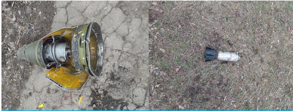
Cluster munitions sighted in Ukraine. Photos featured in recent HRW reports

In a statement made on 2 March 2022, the United Kingdom, in its capacity as CCM 10MSP President, expressed its grave concern at the reported use of cluster munitions in the Russian invasion of Ukraine. The UK called upon all those that continue to use such weapons to cease immediately and urged all states that had not join the CCM to do so without delay. Echoing the Lausanne Declaration adopted at the 2RC in September 2021, the UK condemned any use of cluster munitions by any actor.