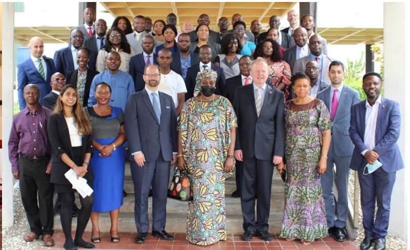
CCM Africa Regional Universalization Workshop in Abuja, Nigeria

The CCM Africa Regional Universalization Workshop took place in Abuja, Nigeria, on 23-24 March 2022. The two-day workshop brought together 8 out of the 9 CCM Signatory States, 2 States not Party and 4 States Parties from the region. States yet to join the Convention were given an opportunity to share the perceived obstacles and challenges faced in joining the CCM and to provide an update on the status of their national ratification/accession. African States Parties were also on hand to share their experiences in joining and subsequently implementing the Convention. A closed-door military-to-military