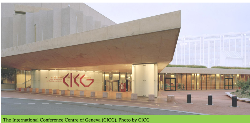
The International Conference Centre of Geneva (CICG).