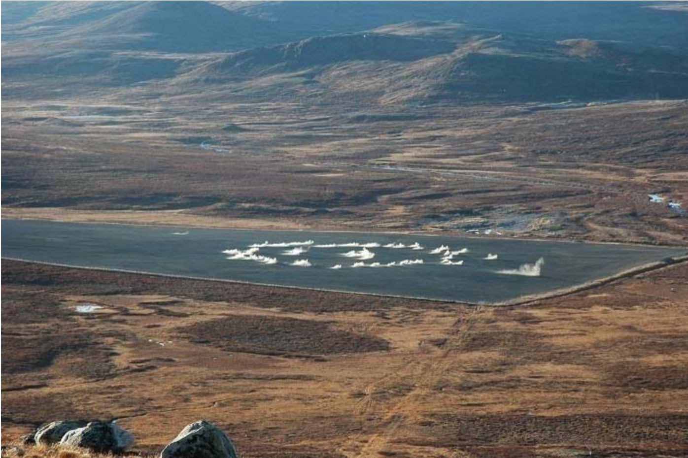
M-85 Cluster Strike test