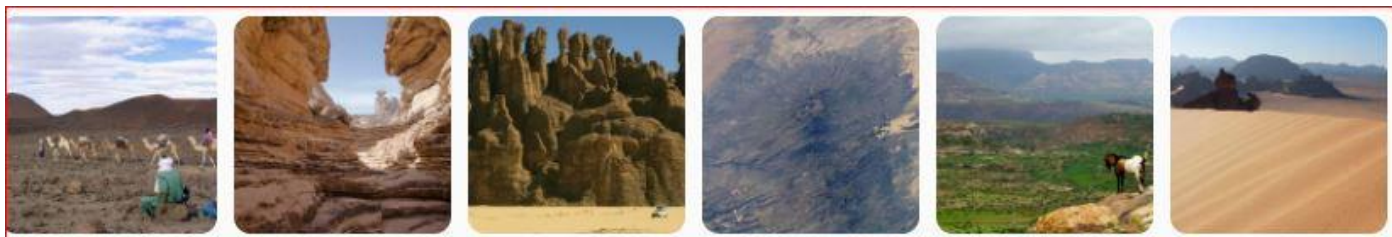
Terrain images of the Province of Tibesti

Tibesti is undoubtedly the most disadvantaged province of the regions of Chad socio-economically. This situation is essentially due to its isolation due to natural causes (remoteness from decision-making and commercial centres, difficult terrain) aggravated by the politico-military troubles that Chad experienced which affected this region for four decades and the consequences are still noticeable.