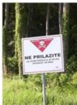
Tabla minske opasnosti