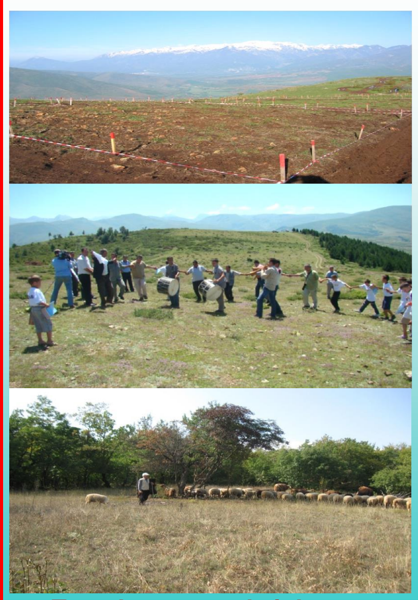
Together we made it happen